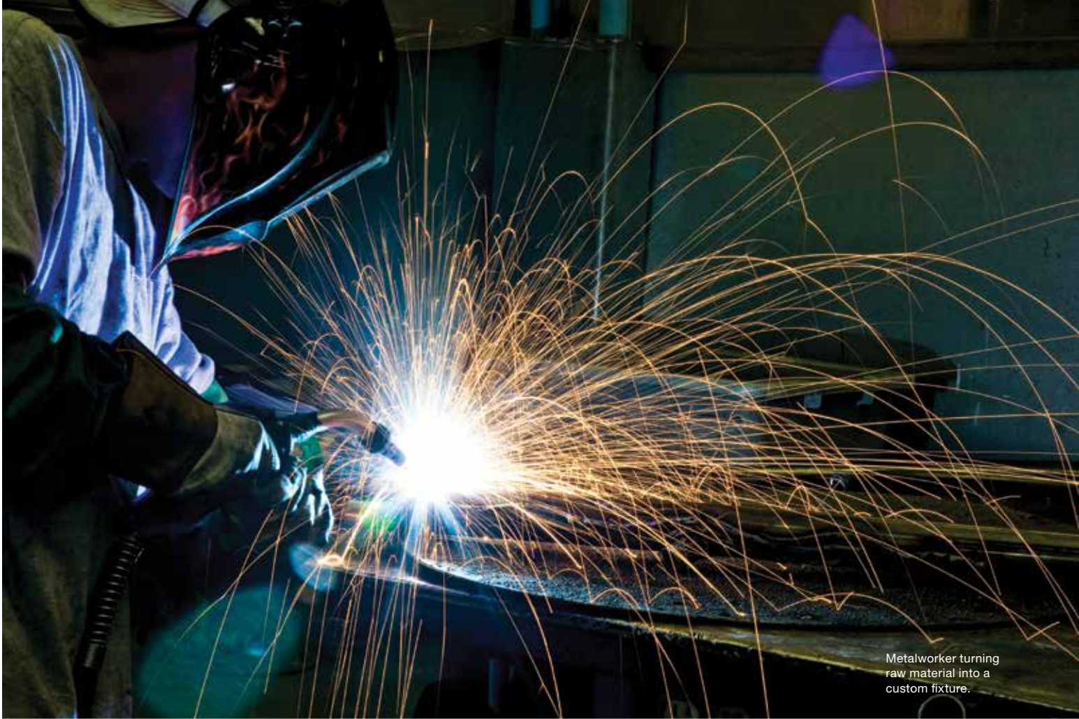
Metalworker turning raw material into a custom fixture.