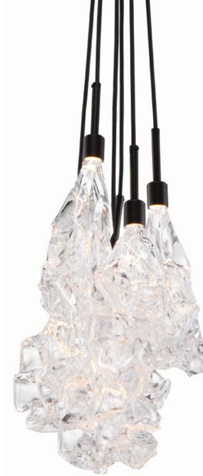
LEFT: Undulant blossoms of hand-blown glass nod to the organic aesthetic of HAMMERTON STUDIO'S "Blossom Cluster" chandelier. hammertonsstudio.com RIGHT: Brutalist design and desert yucca inspire CURREY & COMPANY'S sculptural "Potter" chandelier. curreyandcompany.com