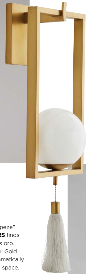
ABOVE RIGHT: A steel "Trapeze" sconce from ARTERIORS finds equilibrium with its glass orb. arteriorshome.com RIGHT: Gold "Saucers" from ET2 dramatically hover as if coming from space. et2lightinglights.com