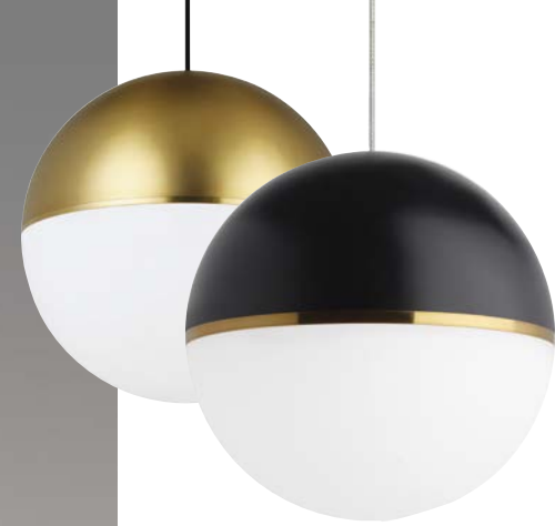
LEFT: "Akova Grande" pendants by TECH LIGHTING transform spheres into chic midcentury art. techlighting.com RIGHT: Shades nest in each of the heavy gauge rings of MAXIM'S "Meridian" chandelier painted in natural aged brass. maximlightinglights.com