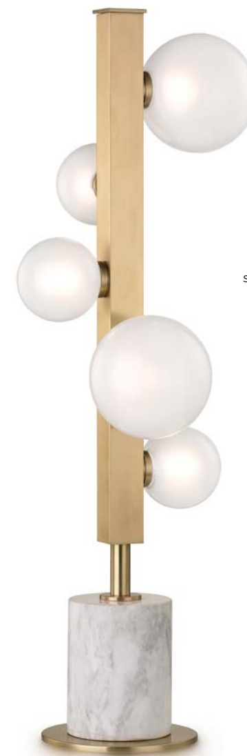
LEFT: Solid marble shapes the base of HUDSON VALLEY'S "Mini Hinsdale" lamp. hudsonvalleylighting.hvlggroup.com RIGHT: Line, shape and form highlight the rings of the contemporary "Berkley" fixture from EUROFASE eurofase.com BELOW: A quick spin on canopy design, the "Bloom" LED pendant by MODERN FORMS offers a unique and distinctly different look. modernforms.com

THIS YEAR'S LIGHTEST AND BRIGHTEST ILLUMINATIONS UNVEILED AT LIGHTOVATION