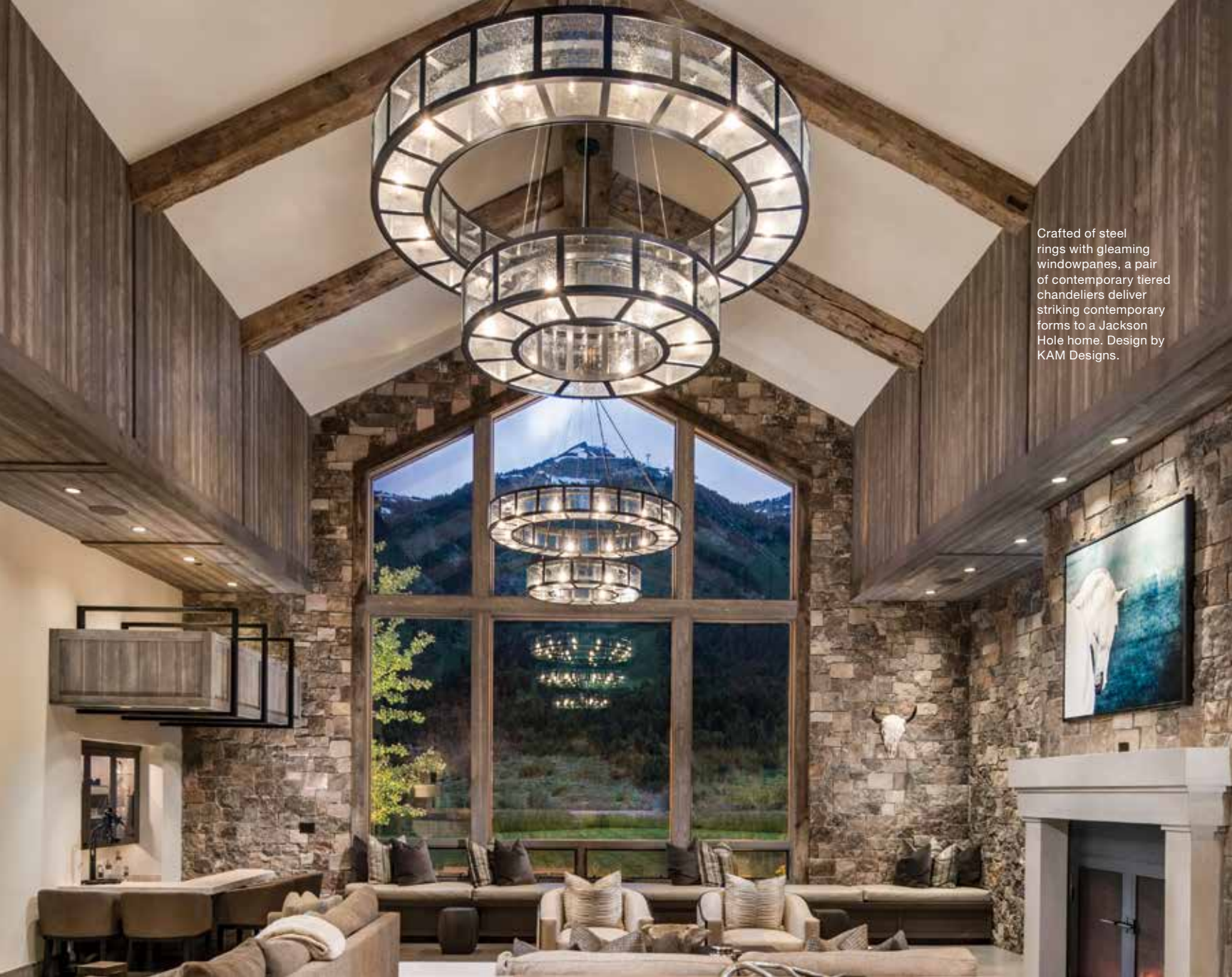
Crafted of steel rings with gleaming windowpanes, a pair of contemporary tiered chandeliers deliver striking contemporary forms to a Jackson Hole home. Design by KAM Designs.