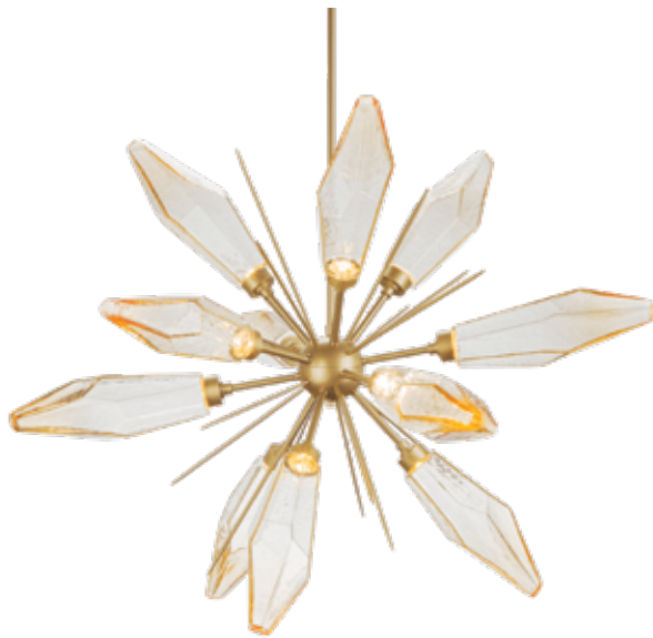
Hammerton's Rock Crystal Chandelier captures the raw beauty of natural quartz in artisan-blown glass.

and then to the modern and contemporary styles we celebrate today. All the while, Hammerton's designs remained on the leading edge, and as consumers' tastes and wants changed, so too did the company.