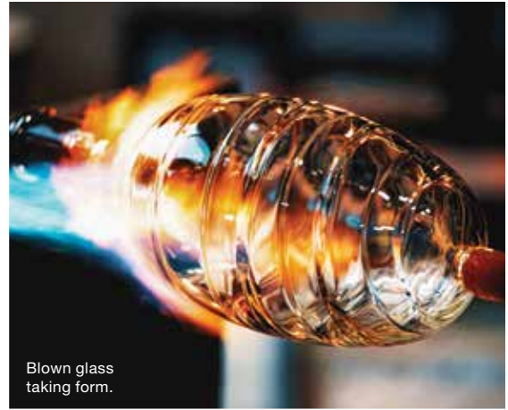
Blown glass taking form.

Measuring 27 feet in diameter and weighing over 3 tons, this sculptural chandelier illuminates the upscale Tysons Galleria located just outside of Washington D.C. Hammerton worked with Illuminating Concepts to design and fabricate this exclusive piece.